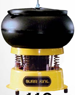
110 11000 shown