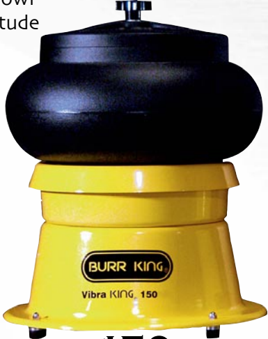
150 15000-1 shown