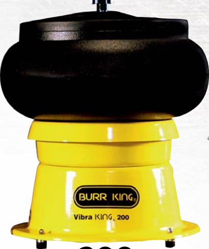
200 20000-1 shown