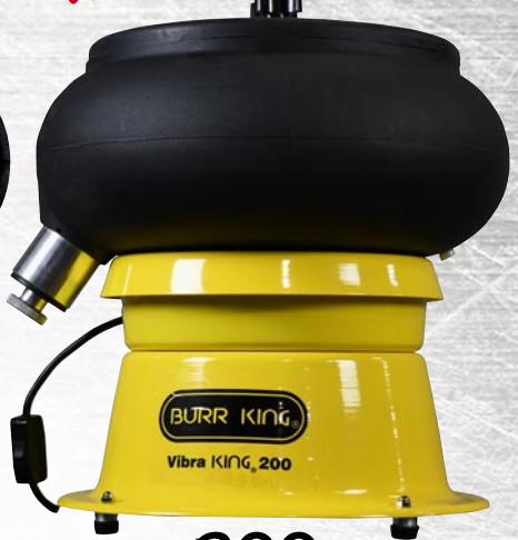
200c 20000-3 shown

Burr King vibratory bowls are ideal for bench top polishing, descaling, deburring, and surface conditioning. Units are fast, quiet, and effective. Available in 3 qt, 10 qt, 20 qt, and 40 qt volumes. New 200c with discharge chute now available.