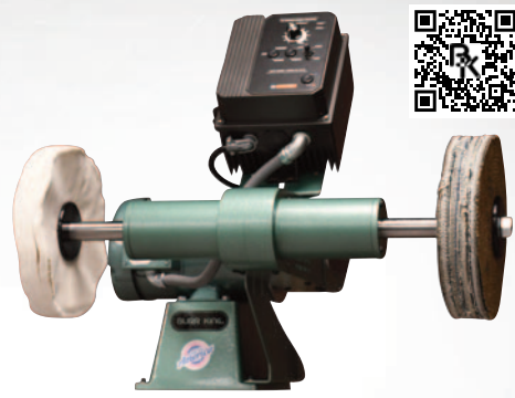
Need something larger? The 1001 can accommodate up to 10" diameter wheels.