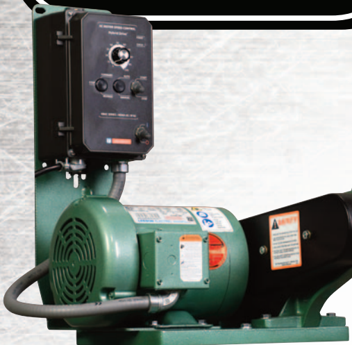
6110 shown with included WA1 adapter and variable speed control