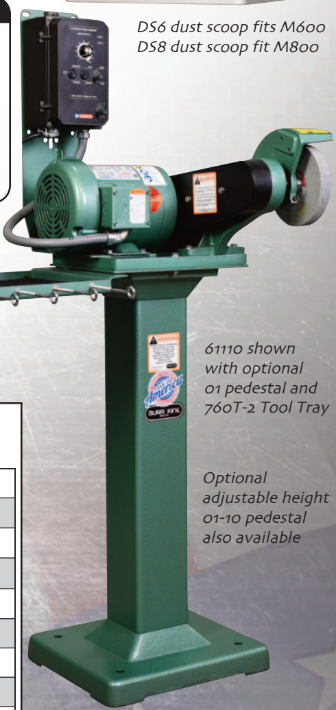
6110 shown with optional 01 pedestal and 760T-2 Tool Tray