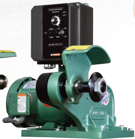
8110 shown with included WA14 adapter and variable speed control