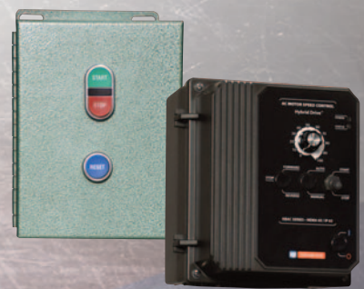
Optional magnetic starters or variable frequency drives are available on the Model 1000 and Model 1200 polishing lathe.

The Burr King 1000 and 1200 are designed for use with soft cloth or surface conditioning wheels only. Specific polishing applications may require additional installation of safety devices. Please consult with a safety engineer before use. Machine includes flanges and nuts, all wheels, pedestals, and dust scoops sold separately.