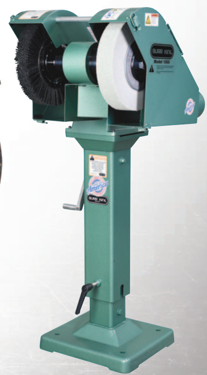
The fixed speed 14200 Model 1000 polishing lathe shown on an 02-10 optional adjustable pedestal.

CHOOSE THE MODEL 1000 AND RUN WHEELS UP TO 10" IN DIAMETER. THE MODEL 1200 WILL RUN UP TO 12" DIAMETER WHEELS.